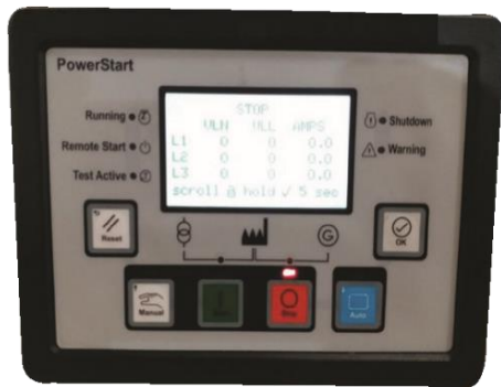
PowerStart 600 control operator /display panel

Generator set control PowerStart 600 – The PowerStart control is a microprocessor-based generator set monitoring and control system. The control provides a simple operator interface to the generator set, auto/ manual and remote start/stop control and shutdown fault indication. The integration of all control functions into a single control provides enhanced reliability and performance compared to conventional generator set control systems. This control has been designed and tested to meet the harsh environment in which gensets are typically applied.